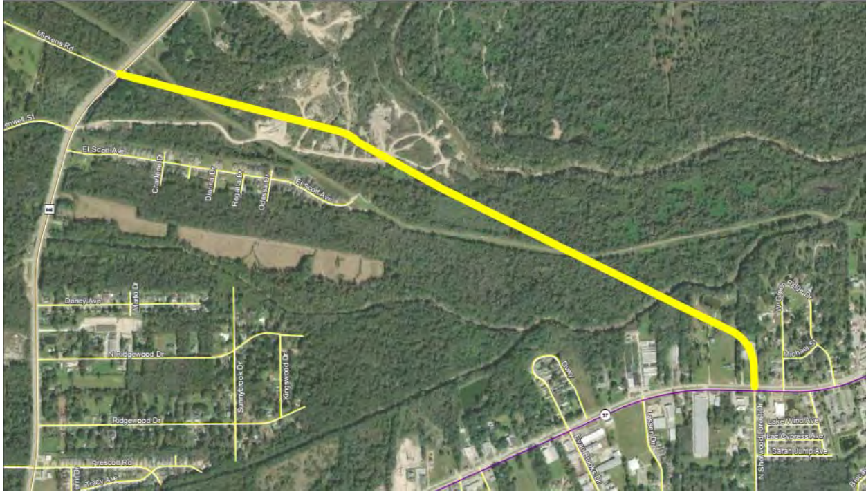
Image above represents broad outline of the project area as shown in 2018 MOVEBR tax plan proposition