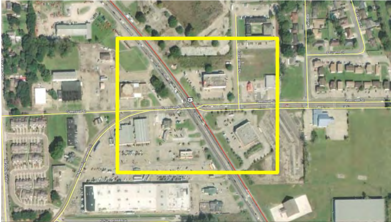
Image above represents broad outline of the project area as shown in 2018 MOVEBR tax plan proposition