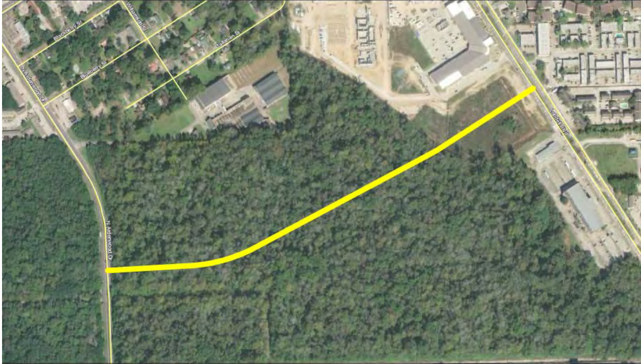
Image above represents broad outline of the project area as shown in 2018 MOVEBR tax plan proposition