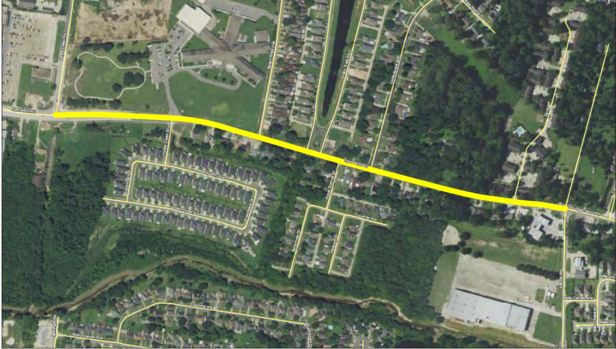
Image above represents broad outline of the project area as shown in 2018 MOVEBR tax plan proposition