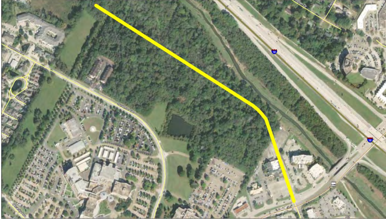
Image above represents broad outline of the project area as shown in 2018 MOVEBR tax plan proposition