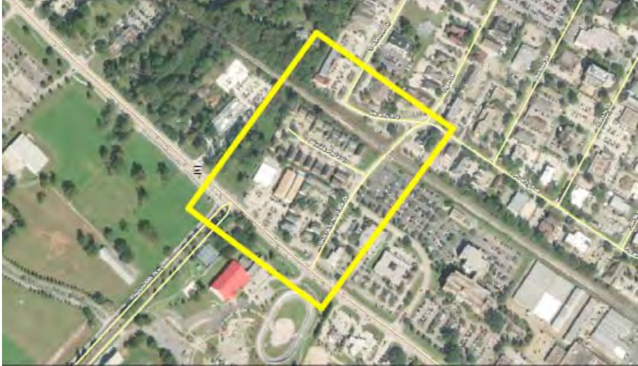
Image above represents broad outline of the project area as shown in 2018 MOVEBR tax plan proposition