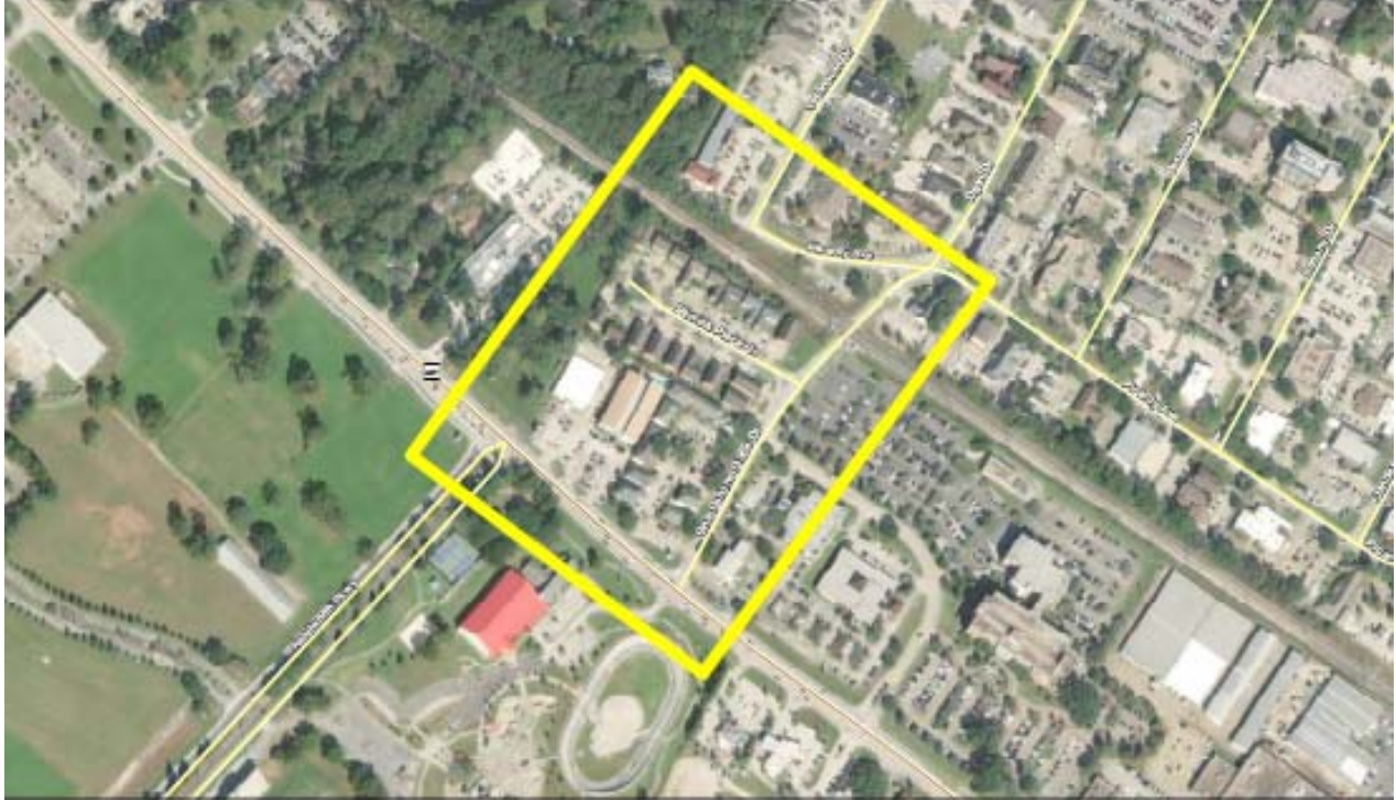
Image above represents broad outline of the project area as shown in 2018 MOVEBR tax plan proposition