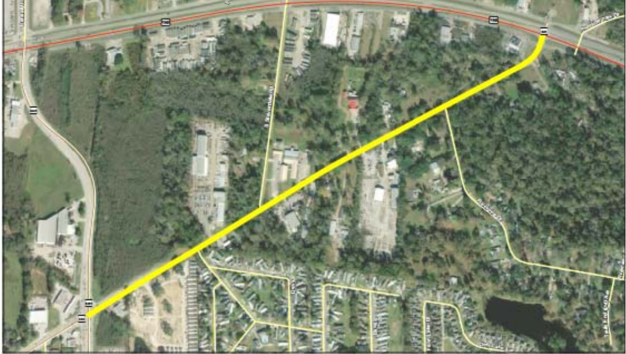
Image above represents broad outline of the project area as shown in 2018 MOVEBR tax plan proposition